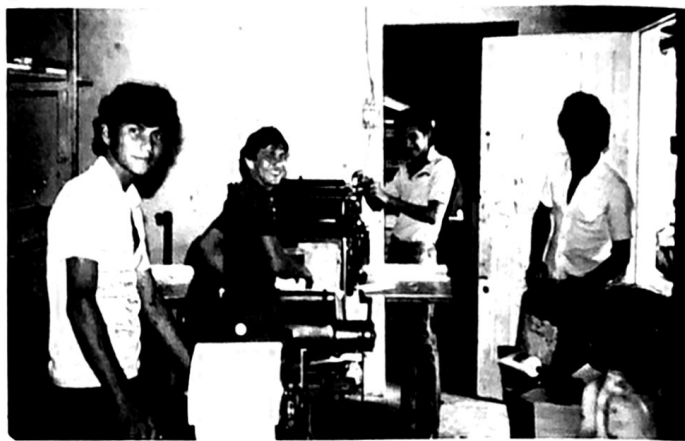
Tabernacle Baptist Church print shop. These young men of the church printed 40,000 circulars to be distributed to 40,000 homes in Manaus, Brazil, that led to the large crowd of about 2800 that came as shown in the four pictures on page one.

Missed Mailing Letter For Feb. Mission Sheets . . . First Miss In 20 Years . . . Trip To Cana On River Urubu . . . Much Work And Some Problems At 14th December Church . . . To Return To Cana On Rio Urubu In Feb. . . Baptized 11 At Watch Night Service . . . S.S. Attendance About 475 . . . In Attendance Drive Contest With Addyston Baptist Church In Ohio . . . Makes Plea For Increase In Regular Offerings