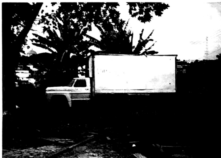
This truck is the property of Tabernacle Baptist Church, Manaus, Amazonas, Brazil. The back of this truck forms a "STAGE" and Pulpit which is used for outdoor services in different parts of the city.