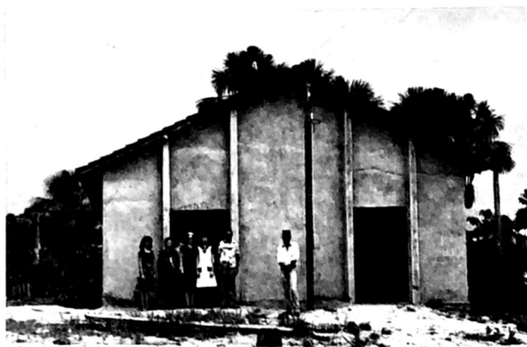
Front view of the new church building in Japiim, Acre Brazil. This building built completely by the members of the church. Mike Creiglow taught them well. In front center is Mike Creiglow. His mother stands in the center of the picture on the left.