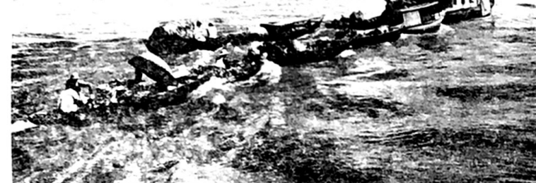
A tug boat pulls nine smaller boats on the Rio Negro River with people from the interior taking their produce to Manaus, Brazil, to sell.