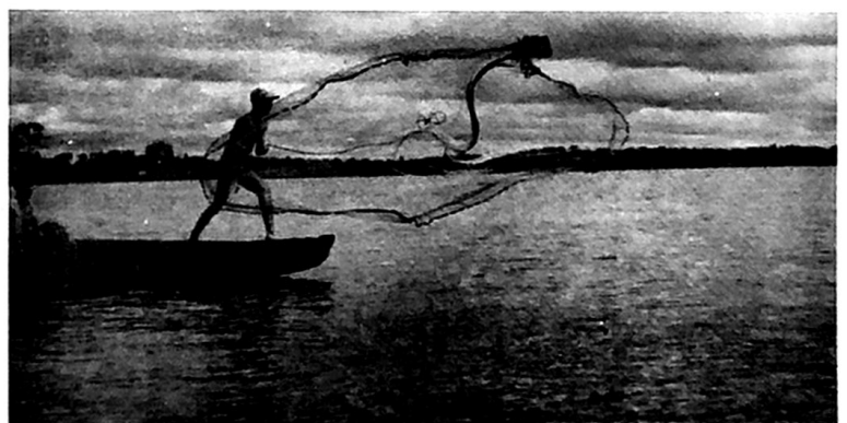
This fisherman spreads his net into the Amazon River near Iquitos, Peru to catch fish to feed his family.