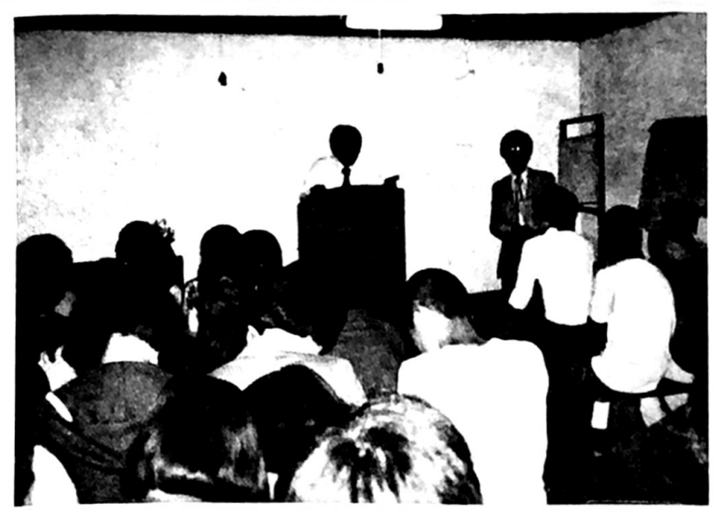
I, Korea August 1, 1980.