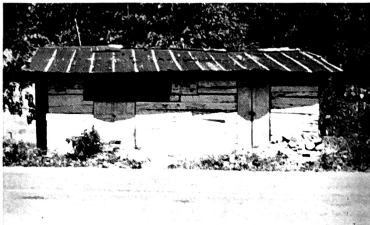
This is the Mission building in Las Palmas on the road between Huanuco Peru and Tingo Maria. The mission has a native Peruvian pastor.