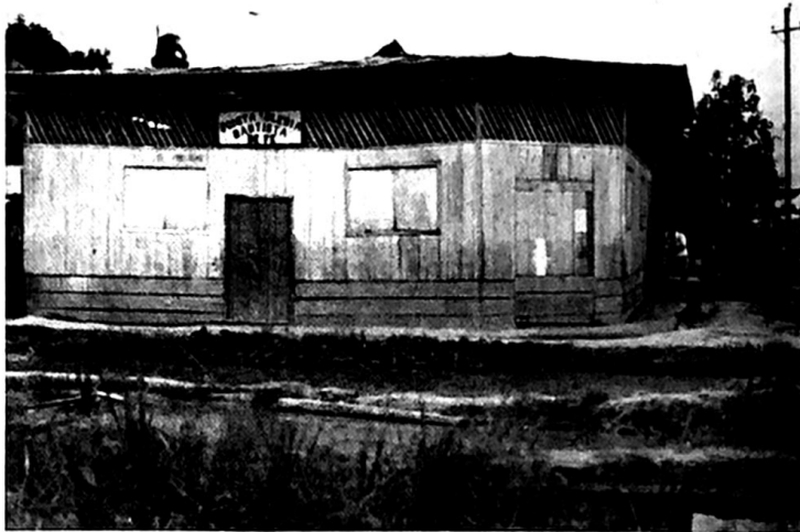
Fifth Baptist Church building in Iquitos, Peru. This church has a native pastor.