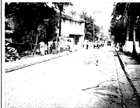
The street in front of the new mission of Louie Carver in the Philippines.