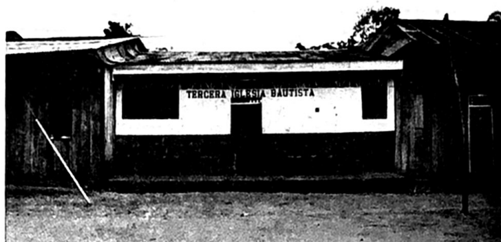
Third Baptist Church building Iquitos, Peru. Now the work of James Gasque.