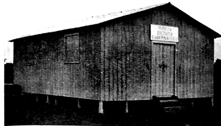
New church building at Rodrigues Alves, a few miles up the Jurua River above Cruzeiro do Sul, Acre, Brazil. The members built this building themselves. This is the work of Mike Creiglow.