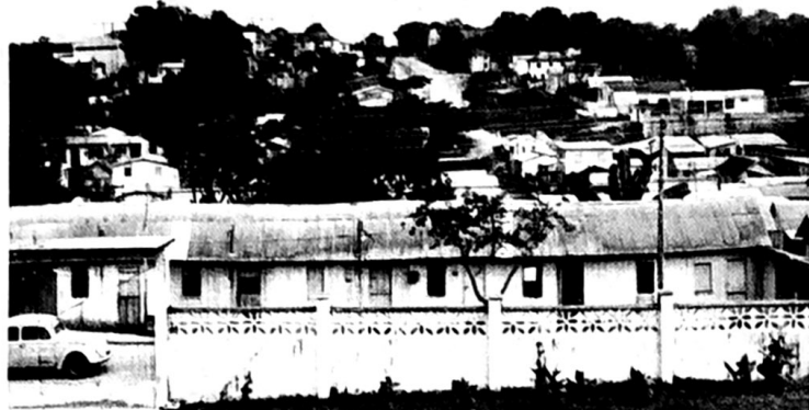
A view from the top step of the front of Fourteenth of December Baptist Church, Manaus, Brazil.