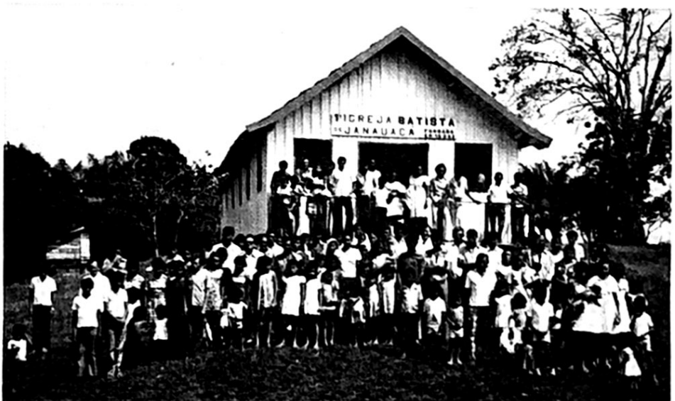
This is a picture of the Baptist Church of Januaca, on a lake just off the Amazon River several hours by boat from Manaus, Brazil. The scenery here is beautiful at this clearing in the jungle. This is a good church with their own native pastor. They come to church in boats. Some of the farmers own large boats and bring boat loads to the church. The work of Baptist Faith Missions.