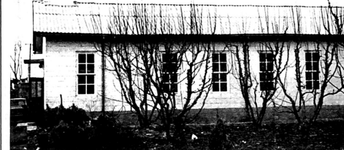
Side view of Shin Nae Baptist Church building, Seoul, Korea. Work of Louis Carver.