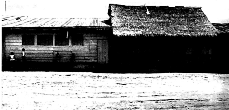
Fourth Baptist Church and pastor's home in Iquitos, Peru. One of six Baptist churches in the city of Iquitos, Peru.