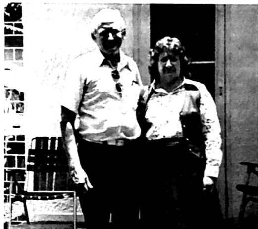
The George Beans