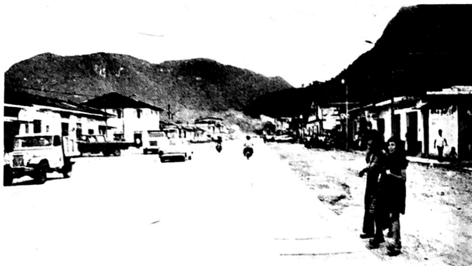
Progress comes to Tingo Maria, Peru. A paved street in the center of town.