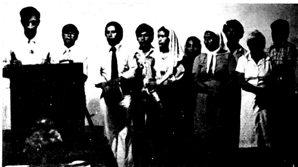
The Choir singing special music in Gethsemane Baptist Church, Tingo Maria, Peru.