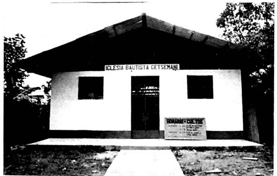
Getsemane Baptist Church building, Tingo Maria, Peru.