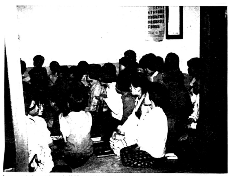
ice at the Kai Pyoung Mission in Korea before the Carvers came home on furlough. With $3,000.00 a new building can be built on this before hard winter sets in