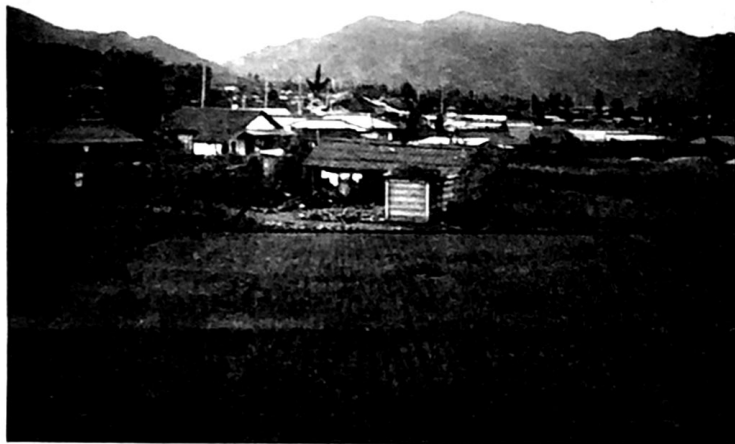
A new mission started by Louie Carver in this area of 20,000 people with no Baptist work. . . Small building in front center on land bought by Louie Carver for a church building for another new work in Korea.