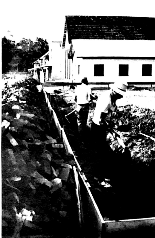
Close up of work digging trenches with old church Building at top of picture. The man with the cap on is Missionary Mike Creiglow. Send a designated offering "For Mike Creiglow Building".