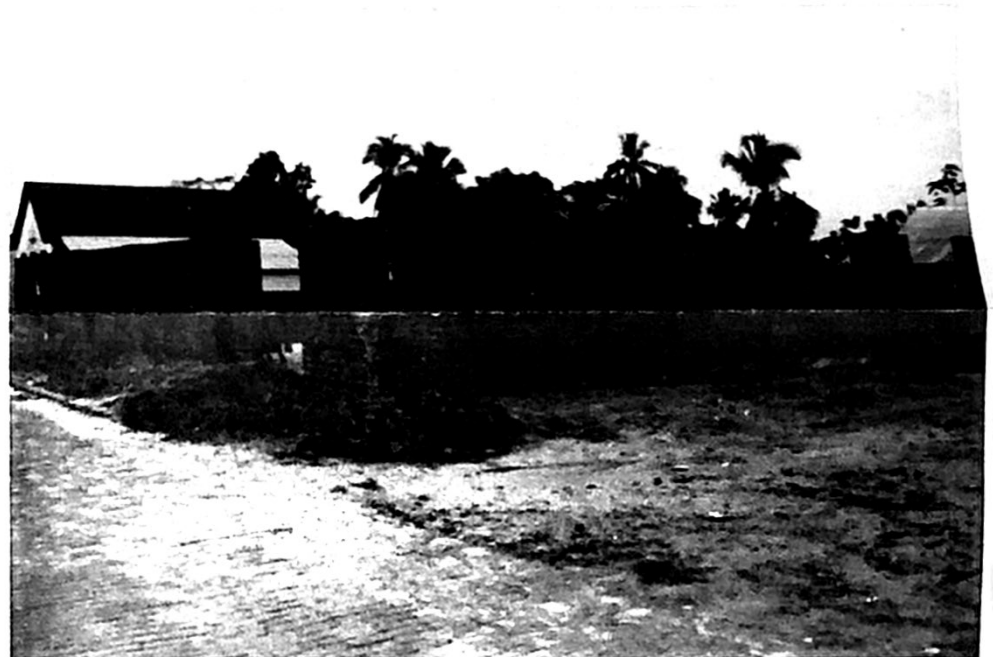
Corner view of the walls part way up of the new First Baptist Church Building, Cruzeiro do Sul, Acre, Brazil. Top of old church building at left over top of new wall. The people had a mind to work. Send a designated offering "For Mike Creiglow Building."