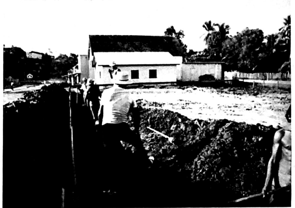
Close-up of men digging the trenches for the foundation of the new building of the First Baptist Church, Cruzeiro do Sul, Acre, Brazil. The church parsonage and old church building roof in center background.