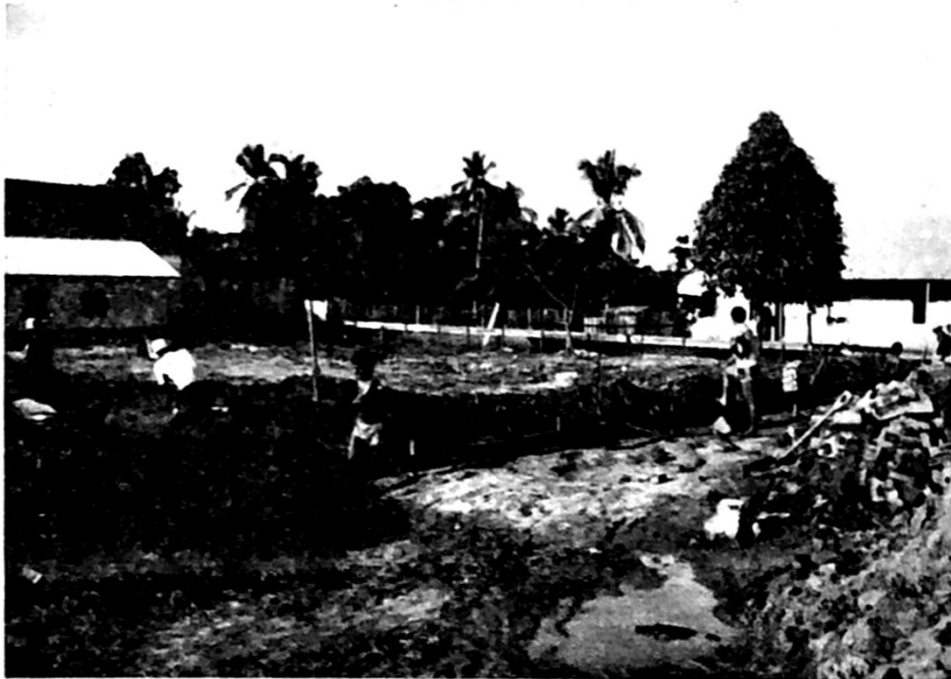
The layout and beginning of digging the trenches for the foundation of new building of the First Baptist Church, Cruzeiro do Sul, Acre, Brazil. Work of Mike Creiglow. Send a designated offering "For Mike Creiglow Building."