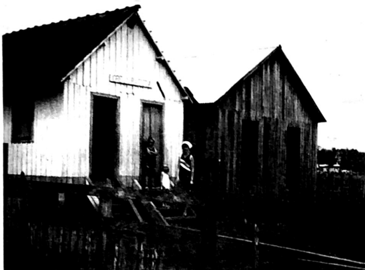
The old Maíta Baptist Church building on the left and the partially built new building on the right. Located on the Moe River out from Cruzeiro do Sul, Acre, Brazil. One of eleven churches of Mike Creiglow's work.