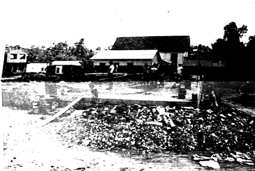
The foundation walls are in and the concrete floor is poured for the new building of the First Baptist Church, Cruzeiro do Sul, Acre, Brazil. Part of the wall in rear center of picture. Parsonage and old church building in rear center of picture.