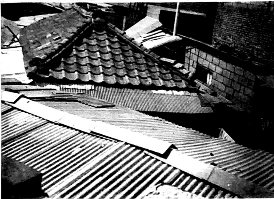
This picture was taken over the top of the wall showing the building site for Faith Baptist Church, building, Seoul, Korea. The shacks to be torn down. Pray and give that the new building may be built.