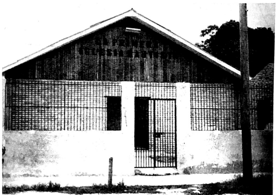
This is the new First Baptist Church Building, Iquitos, Peru, built on the back of the house that the Kissels live in. Brother Kissel built this himself with some hired help. Notice the height of the wall and steel fence in front. The wall this high is around the front and side of the house.