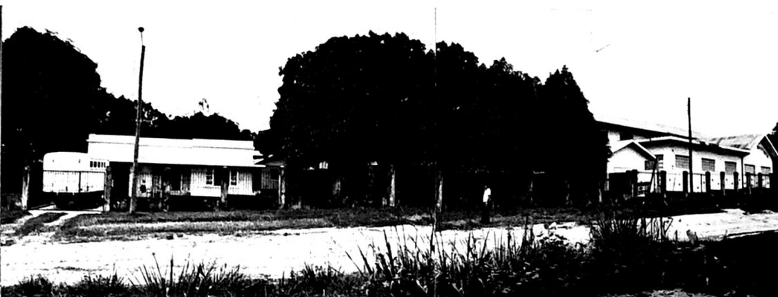
The Del Mayfields and view in front of their house in Pucallpa, Peru. Please help pay the deficit of $1,291.42 on these buildings.