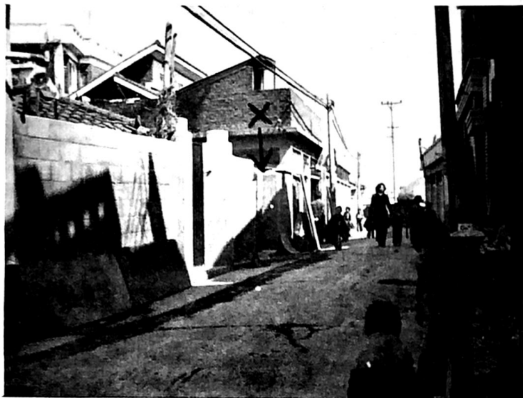
The arrow under X points to the entrance to the building site for Louie Carver's new building in Seoul Korea. The building is to be three stories. Ground floor for the church. Second floor for Preacher's College and third floor for an apartment to live in. Total estimated cost to build is $50,000.00. He would like to build the first floor before furlough time in 1979. This is estimated to cost about $20,000.00. Who will give to build it?