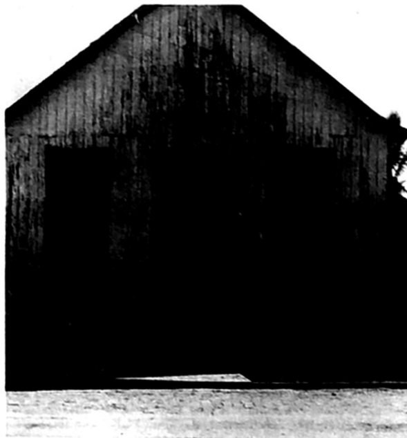
First Baptist Church, Cruzeiro do Sul, Acre. Organized May 12, 1929. The first Baptist Church organized in Brazil west of Manaus in all of Brazil. This church plans a 50th ANNIVERSARY SERVICE on May 12, 1979, the Lord willing. Let's help them get a new building for the occasion.