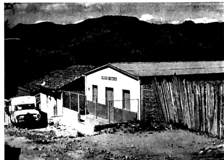
Ayestas Baptist Church, Tegucigalpa, Honduras. Work of Walter Lauerman

EDITOR'S NOTE: Creiglow's application for exemption rejected and he cannot leave Brazil for furlough and not lose his permanent visa unless he deposits $4,500.00, which will be returned after furlough.