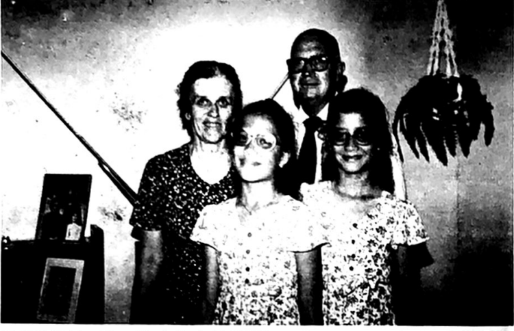
lobby Creiglows, Varzea Grande, Brazil, July 1978. They are di rears in Brazil since last furlough