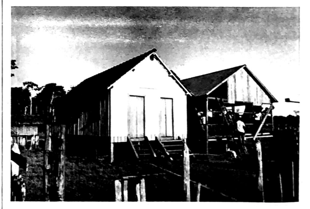
Church at Maitai with then new church larger church building being built by the members themselves. On the Mos River out from Cruzeiro do Sul, Acre. Work of Mike Creiglow.