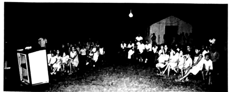
Outdoor night service at Rodrigues Alves with small church building in rear. They are building a new larger church building themselves. Work of Mike Creiglow.