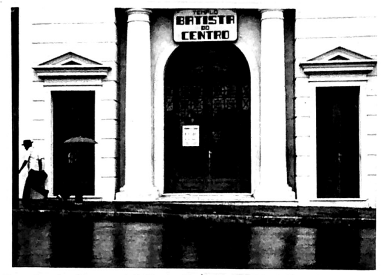
Close-up front view of entrance to the building that John Hatcher wants to buy in Garca Brazil. We need ab $75,000.00 to close the sale.