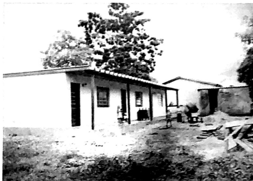
Sunday School building of three class rooms showing rear of church building and tool shed still on lot. Needs special offerings for fence in front and walls around sides.