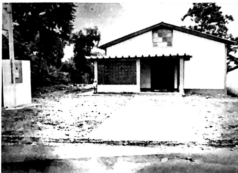
Bobby Creiglow's new finished church building, Varzea Grande, Mato Grosso, Brazil. The lot, this building, and the one in the rear has cost $24,000.00. Needs $7,480.17 to pay deficit. This building dedicated Dec. 19, 1977