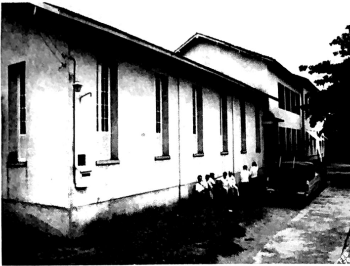
Side view of Tabernacle Baptist Church, Manaus, Amazonas, Brazil showing the two, two story buildings in rear of the church building.