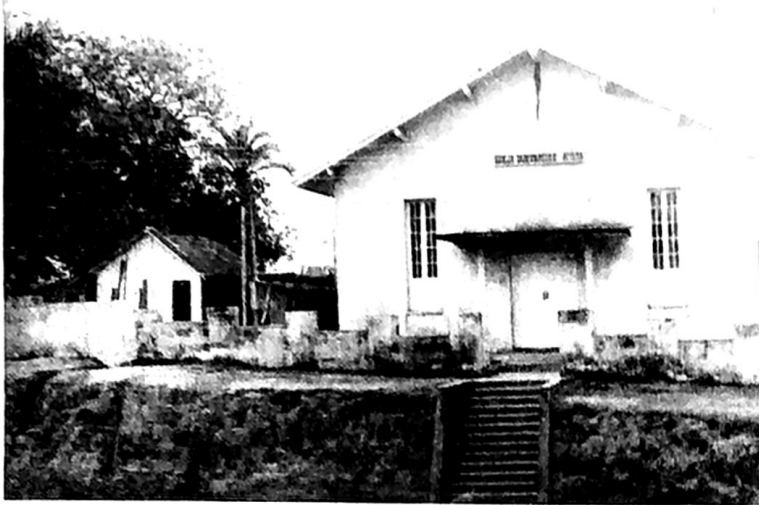
Tabernacle Baptist Church, Manaus, Brazil. Directly back of this building are two, two story buildings for the schools. The small house to the left is for storage. Now see the picture to the right.