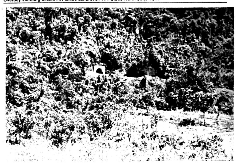
Driving in the mountains between Huanuco and Pucalipa, Peru. Art Gibbs took us through this tunnel to the other side of the mountain. July, 1977.