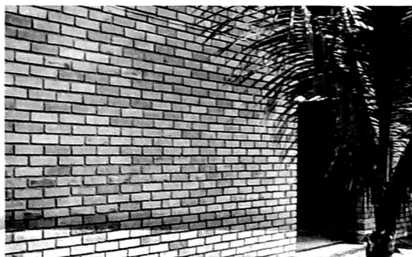
Front view of the new First Baptist Church Building, Iquitos, Peru. Front door beyond the palm tree. James Kessel laid these bricks himself. The cost to build this building will come from the sale of the old First Baptist Church, building which is on the corner of a busy intersection and so noisy that one cannot hear in the services.