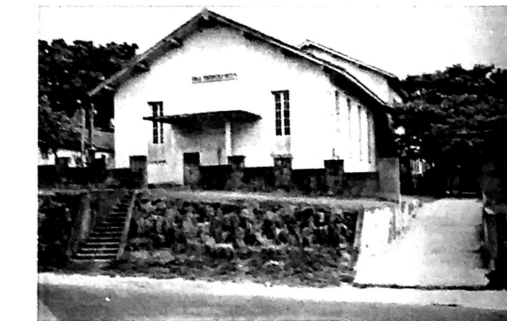
Front view of Tabernacle Baptist Church, Manaus, Amazonas, Brazil. Note the top of the school building back of the church building. Paul Hatcher is pastor of this church and head of all the schools with 1065 students.