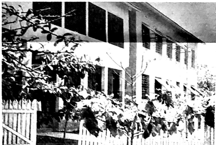
Side view showing the two story school building, in the rear of Tabernacle Baptist Church, Manaus Brazil. There is another school building to the front and right of this picture. Grades from kindergarten through High School, and a Seminary (college) also. All these buildings are paid for and the schools are now self supporting. We thank God and take courage.