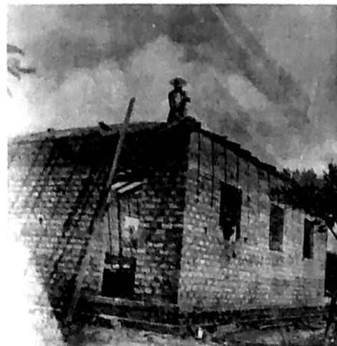
Putting the roof on the "George Bean Building" at Anajatuba. From the picture on the left to this. The building is now completed. Need offerings to finish paying for it. Mark special offerings for "Bean Building."