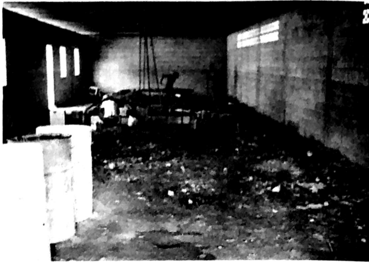
"Lauerman Building", Pradera. Wall up, roof on, man laying blocks for baptistry and footings for classrooms in rear. From picture at left to this. Hopes to finish building in two more months. Mark special offerings "For Lauerman Building."