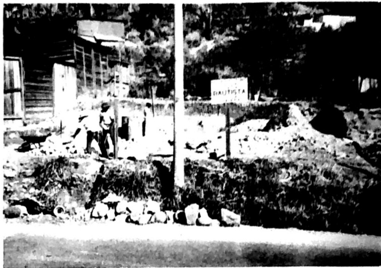
Lauerman Building in Pradera. Note how much dirt had to be moved back to the rear to make level for the building. This dirt was moved by wheelbarrow across the road into a large hole. See picture at the right for progress.