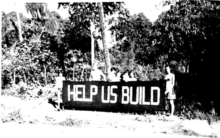
Lot on paved street in city of Verzea Grande, Brazil for Bobby Creiglow's new church building. The bulldozer was to come to clear off the lot. Brother Creiglow wrote on the back of this picture, "This sign cost me less than ten dollars to make, but we hope it will turn into a $10,000.00 sign for the Verzea Grande Building Fund." Please give so that he can build it without having to stop and wait for the funds. Richard Turner will help Bro. Creiglow build.