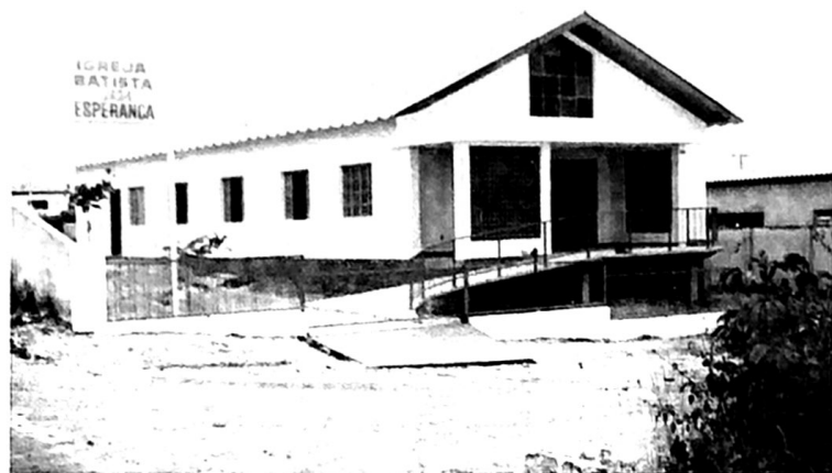
Richard Turner's new church building, Cuiaba, Brazil, now finished, with wall around the lot and steel fence in front with ramp leading up to front entrance to the building. There is room on the rear of the lot to build a house facing the other street. Need offerings to finish paying for the building, and for street paving, sidewalk and house.