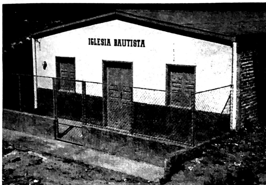
Woodland Baptist Church Building, Tegucigalpa, Honduras. First building built in this city by Walter Lauerman. All paid for.