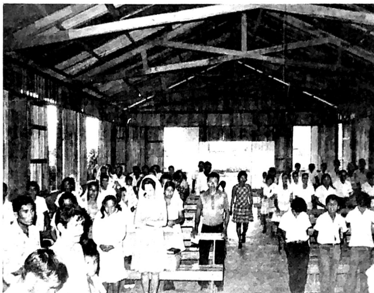
Part of crowd inside new church building at San Fernando (Pucallpa), Peru at the organization of Grace Baptist Church, October 17, 1976.