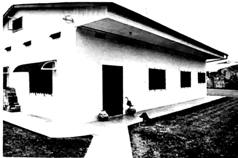
The James Kissel house in Iquitos, Peru. This is the front entrance from the corner of two streets. Windows and doors are barred with steel.