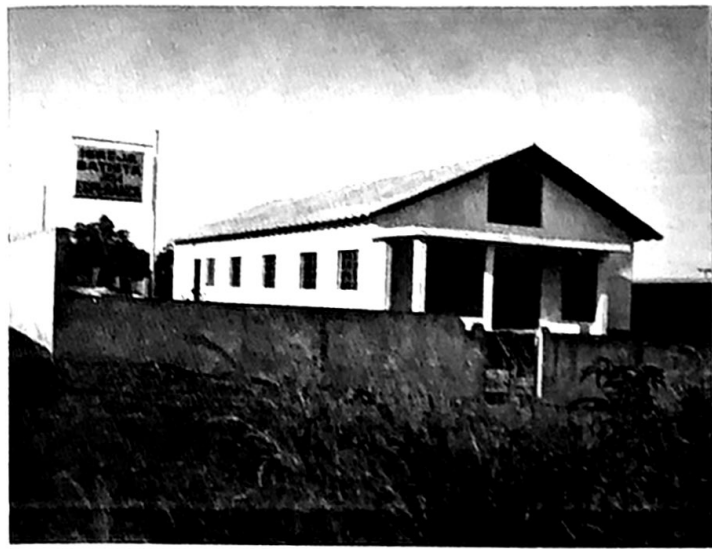
Richard Turner Church Building, Cuiaba, Brazil, with wall around the lot. Built by Bobby Creiglow and Richard Turner. Need offerings to build ramp up to front entrance and finish inside and to build shed in rear.