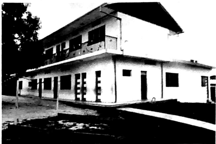
Rear corner view of Del Mayfield's church and two story school building, Pucallpa, Peru.