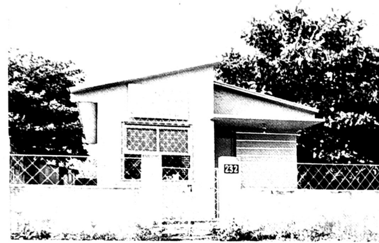
Front view of Paul Hatcher's Kindergarten building, Manaus, Brazil.