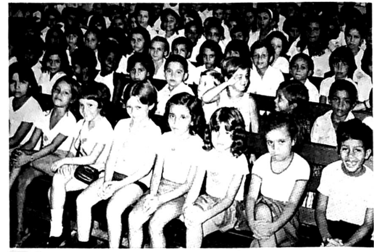
te of the 350 children in the primary department of the Baptist School, Manaus, Amazonas, Brazil. The students hear the gospel every day in school.