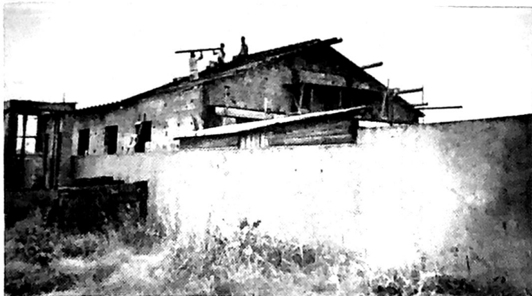
Bobby Creiglow and two members of the mission putting the roof on the new "Turner Building" in Cuibabo, Mato Grosso, Brazil. This picture is taken outside the building looking over the wall. The roof is now completed. About half the plastering is done and they hope to have it to hold services in when the group going to the Conference in Manaus, Brazil arrive. Send a special offering to help finish the building.