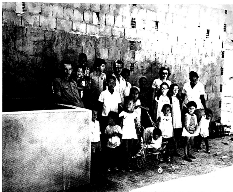
Those who came to the baptizing in Cuiaba, Brazil standing beside the baptistry tank, in the unfinished "Turner Building".