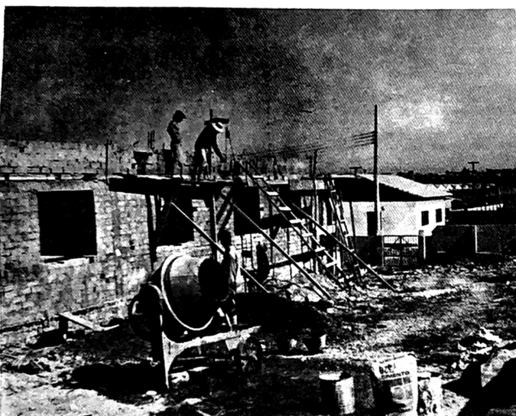
Pouring concrete for top beam and sub floor at same time for porch by Bobby Creiglow and workers. "Turner Building", Cuiaba, Brazil.