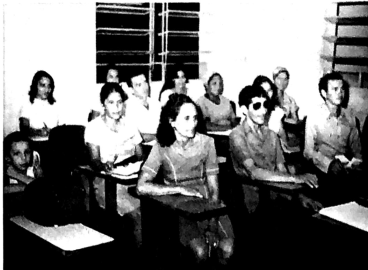
Seminary Class, Manaus, Brazil.