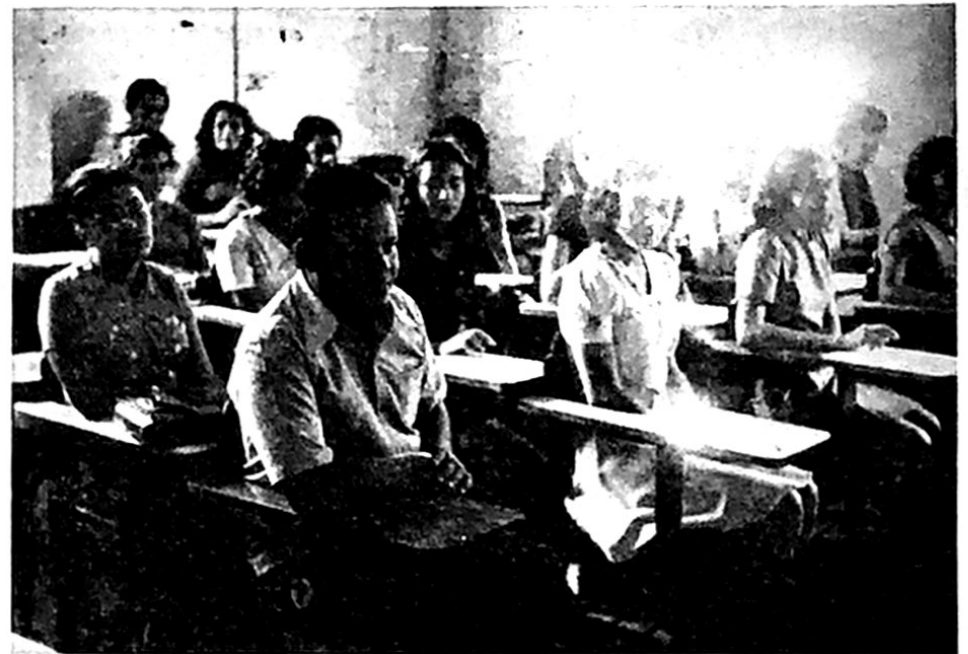
Baptist teachers in "training and planning service" who teach in the Baptist school, Manaus, Amazonas Brazil.