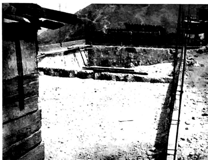
Honduras building project. Note the partly finished concrete wall in the rear. Note steel webbing for reinforcing concrete pillars.