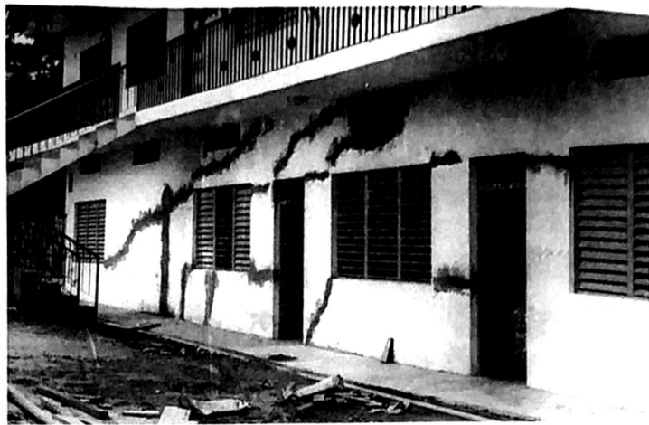
Cracks repaired in Pucallpa building. We trust all will be painted and ready when the touring youth group arrive.