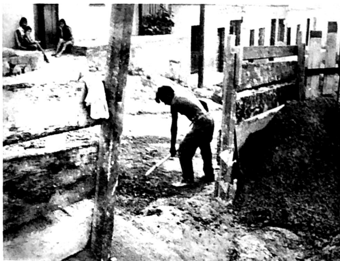
LAUERMAN CHURCH BUILDING IN TEGUCIPALPA. Making concrete mixture for the concrete rock wall.