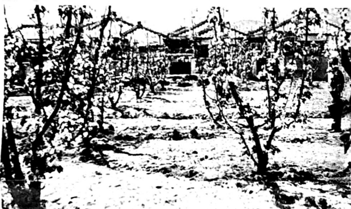
Lot purchased in Seoul, Korea by Louie Carver for church building. Lot cleaned off except for trees. Please give to this project so the church can be built.