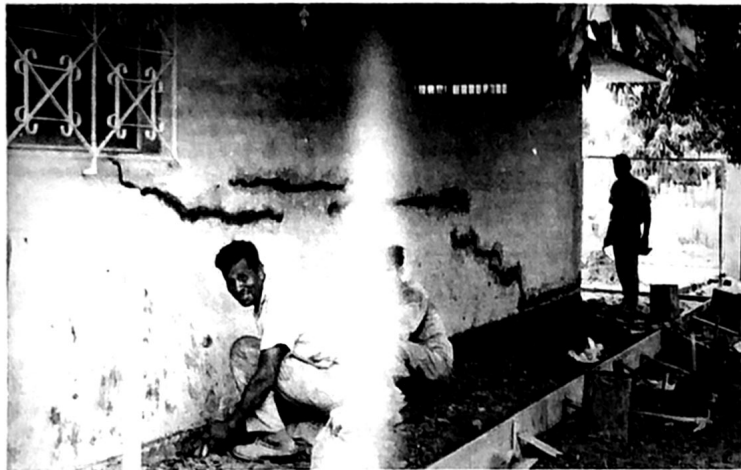
Cracks in one side of Mayfield house, Pucallpa, Peru being repaired, and forms for sidewalk.