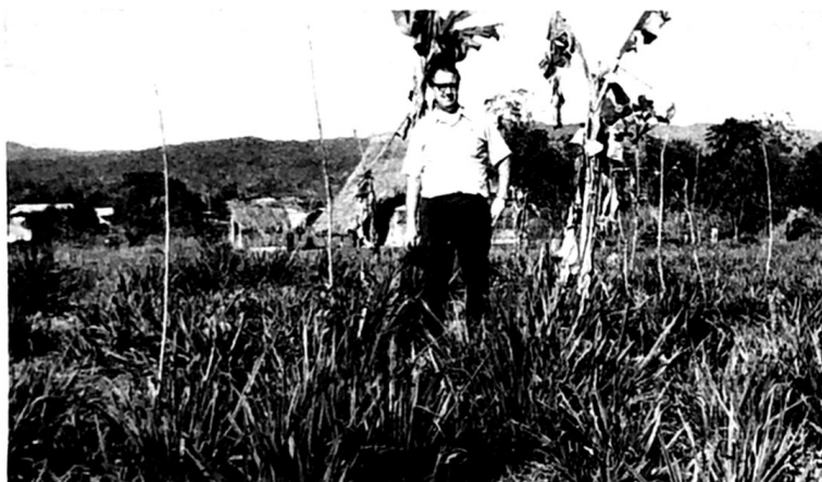
Homer Crain standing on the lot in Aucayacu, Peru after cleaning it off and getting ready to put in the foundation footings for the building, that Terry Leach and the men and youth who are going to Peru in June will build.