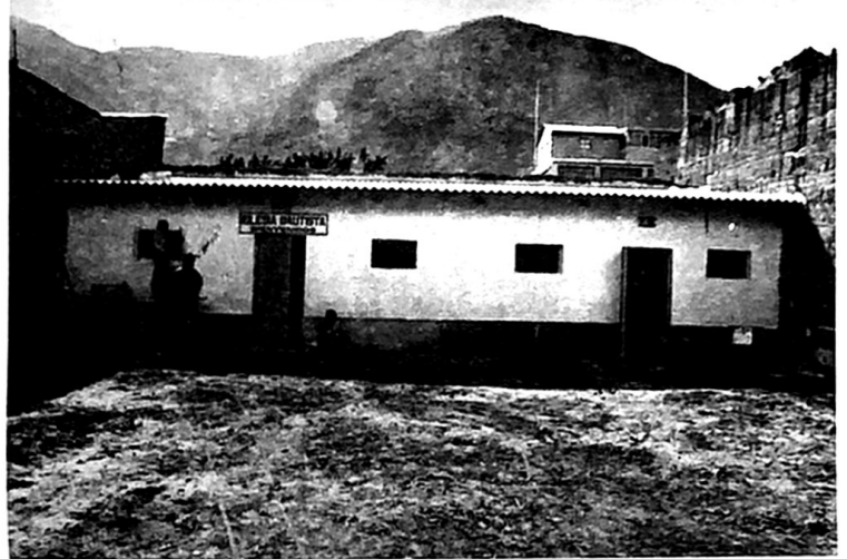
Art Gibbs temporary building on rear of lot, Huanuco Peru. Walls are mud brick dried in the sun and plastered over. Please give so that the permanent building can be built on the front of the lot. Mark your special offering for "Gibbs Building."