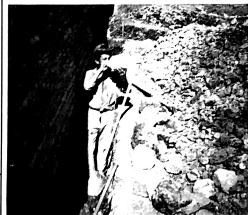
Faustio Garcia digging deep trench for footings of Walter Louerman's church building at Ayestas, in Tegucigalpa, Honduras.