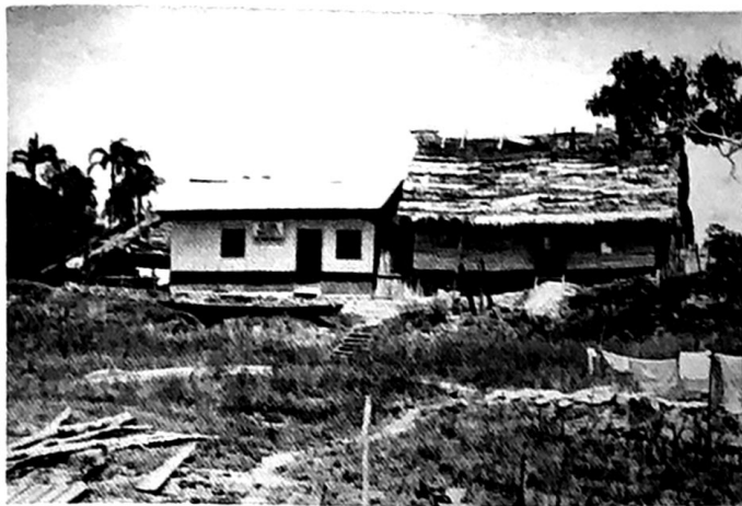
Hojal church building and parsonage on a small stream off the Amazon River down river from Iquitos, Peru. A good church with a good native pastor.