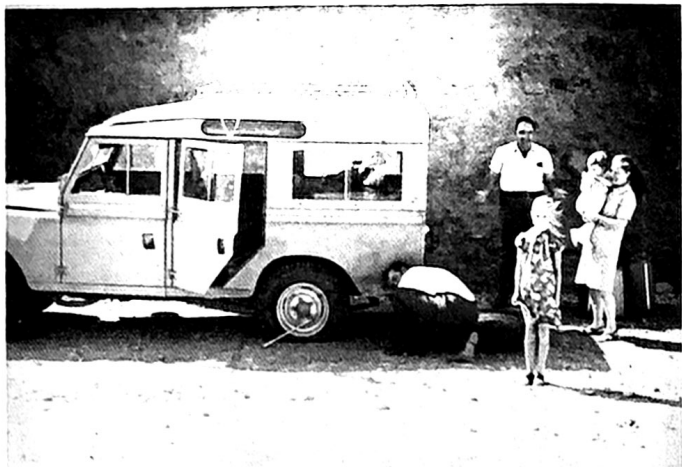
Art Gibbs changing the wheel with a flat tire on the mountain road near Huanuco, Peru. The mountain is high on the other side of the car. Luther Rogers and Mrs. Gibbs and two girls are next to the car.