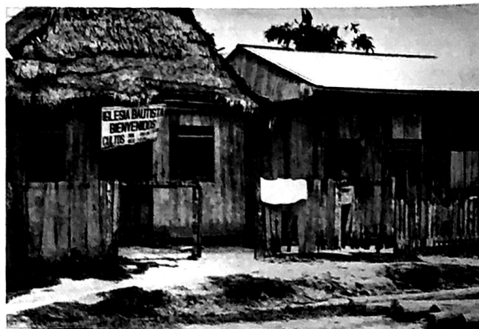
Astoria Baptist Church at the mouth of the Nanay River where it enters into the Amazon River, near Iquitos, Peru.