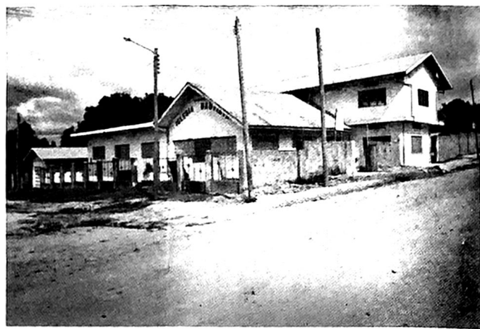
Faith Baptist Church and School building, Pucallpa, Peru. Work of Del Mayfield.