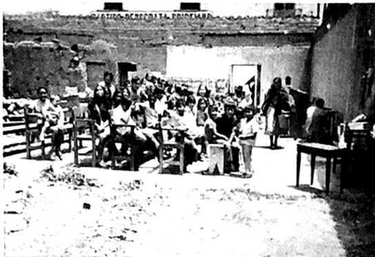
Open-air service on Gibbs's lot in Huanuco, Peru, before temporary building was finished. Note the high mud brick walls and the building above the wall across the street.