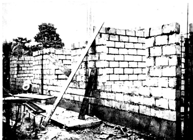
Walls going up in front part of house for the Homer Crains to live in, Tingo Maria, Peru. This replaces the temporary wood wall.