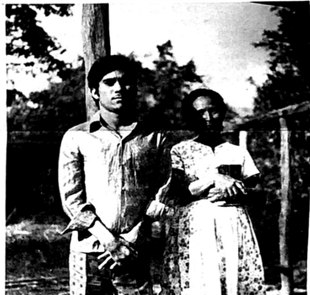
These two were baptized by George Bean into the fellowship of the Baptist Church of Anajativa, July 13, 1974. Two more Baptists in Brazil.