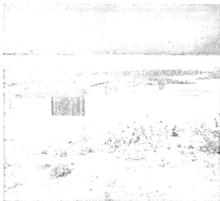
TURNER BUILDING, Cuiaba, Brazil: Wooden gate on other end of lot facing the other street. Lot, walls and gates paid for and ready to build. Pray and give as the Lord shall lead you.