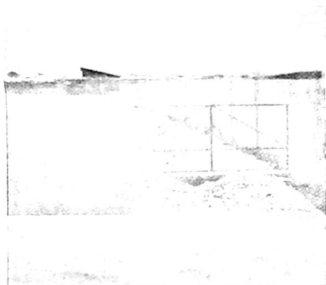
TURNER BUILDING, Cuiaba, Brazil: Walls are finished and steel gate for car entrance on one end facing street. The lot is facing three streets. Four lots cost $3,500.00 now selling for $12,000.00.