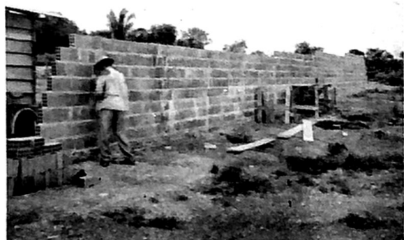
One side of wall around Turner lots, Cuiaba, Brazil. Give to help build the church building. Mark special offerings for "Turner Building".