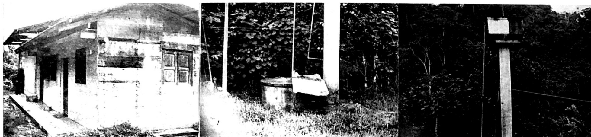
Picture 1 - Front corner of house Homer Crain bought in Tingo Maria, Peru. The walls, wood planks will be replaced with cement blocks. To help on the cost to buy and finish house, mark your special offering for "Crain House". Picture 2 - Well and pump in back yard of "Crain House". Water is pumped into tank on high concrete post for running water in the house. Please help on this project. Picture 3 - Water tank high up. Water from well pumped into this tank for the water to be used in the house. Mark your special offering for "Crain House". Pray and give as the Lord leads you.