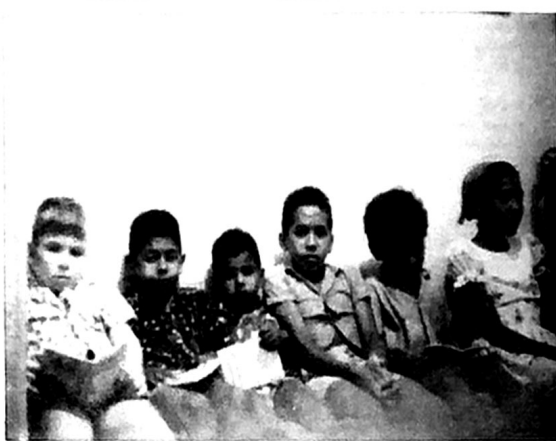
Children in service in Richard Turner mission, Cuiba, Brazil. Mark your special offering for "Turner Building".