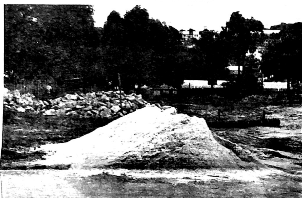
Building sand and stone on site for "Bratcher Building", Manaus, Brazil. Mark your special offering for "Bratcher Building". This project is urgent.