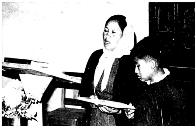
Mother and son singing a special in Ambo, Peru. Her husband is a school teacher and attends the mission regularly and thithes, but a member yet.