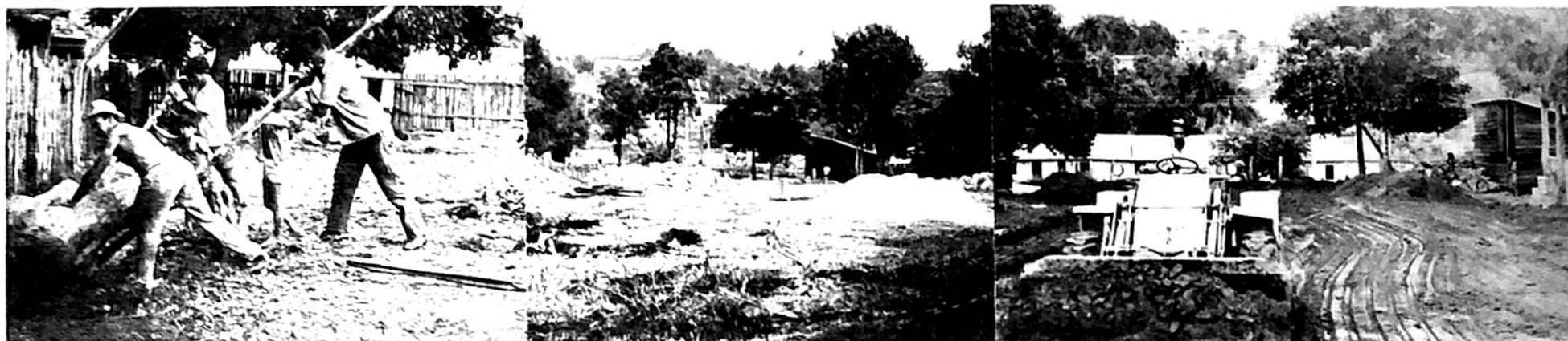
PROJECT BRATCHER BUILDING, MANAUS, BRAZIL: Men moving tree trunk to side of lot . . . crushed stone and sand with shed for tools . . . bulldozer grading lot level to start footings of building . . . note shed for cement and tools with watchman sitting in door. Get this project on your heart and mark your Special Offering for "Bratcher Building".