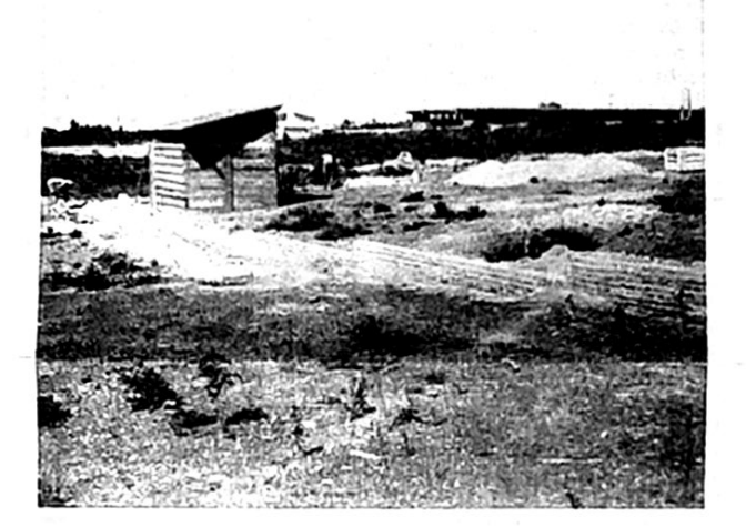
Another view of the building site, Cuiaba, Brazil. Note shed for tools and cement and man near shed laying the wall. The long building in the background is a new school building.