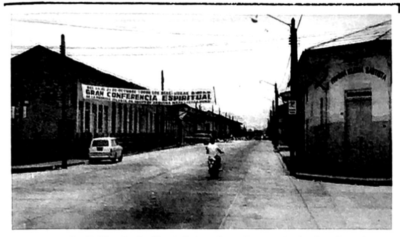
over street beside First Baptist Church, Iquitos, Peru, advertizing Brother Kissel's Conference