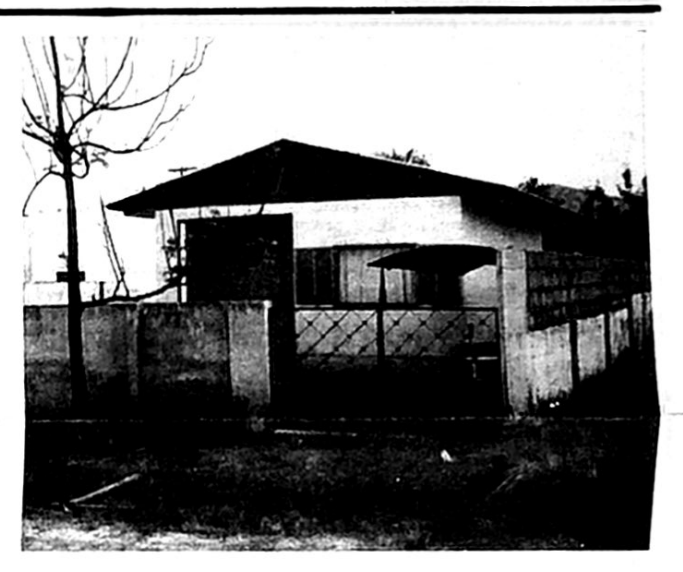
The house that the Richard Turners live in, Cuiaba, Brazil, near the building site for the new church building. Note wall