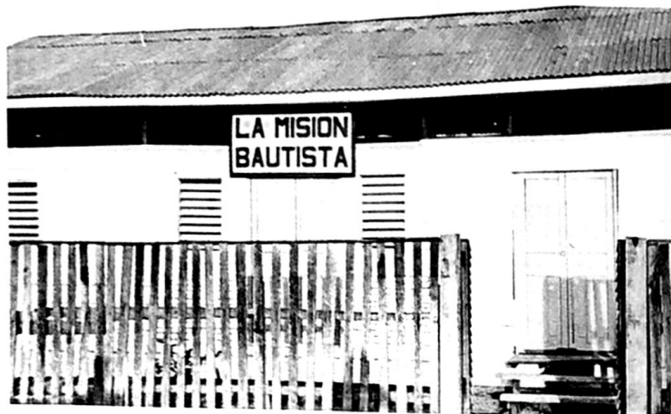
New mission house, San Fernando, Pucallpa, Peru. This house was paid for by a member of Grace Baptist Church, Warren, Michigan through his church.