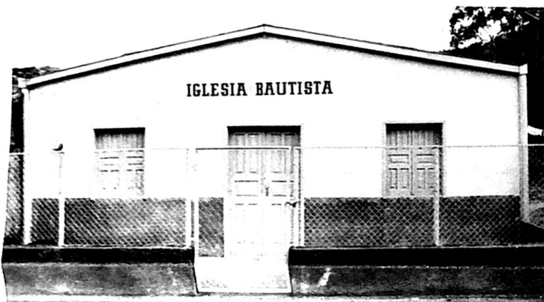
Walter Lauerman's new church building, Tegucigalpa, Honduras where Hafford Overbey preached seven times in October. Auditorium will seat 196 adults.