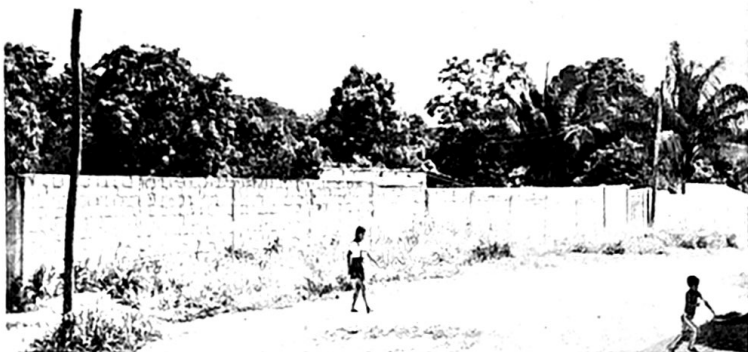
Wall on side around the corner from the two story school building. The property is enclosed with wall fence on all four sides.