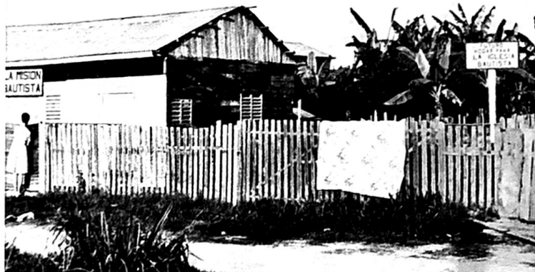
New mission house with lot beside it where a church building will be in the future, the Lord willing. Sign says "Future Home of the Baptist Church".