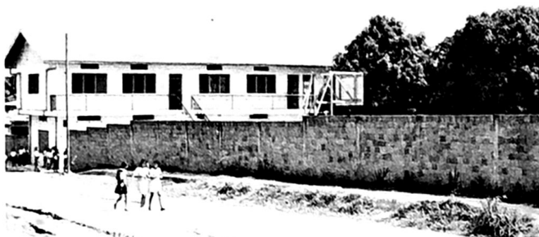
Two story school building showing wall fence to the corner between the two pictures.