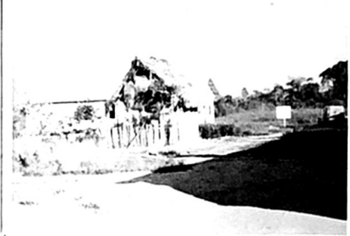
New building at a distance in Aucayacu, Peru, built by the group from the U. S. while there.