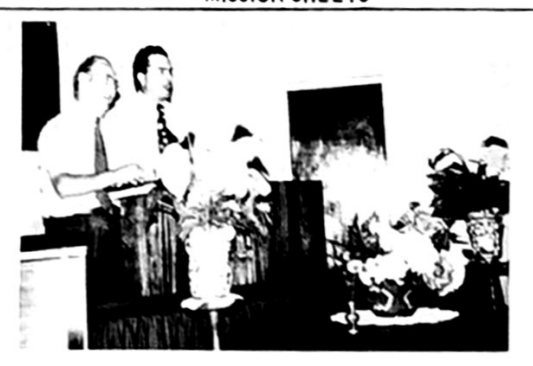
Foith Baptist Church, Pucalipa, Peru.