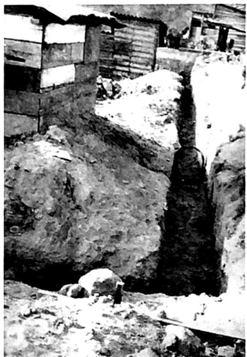
Trench for footing for building in Tegucigalpa, Honduras, being built by Walter Louerman.