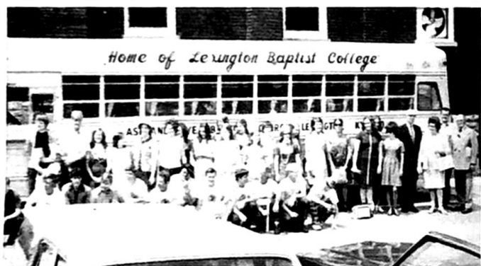
Ashland Avenue Baptist Church bus and group ready to leave for Miami, Florida and then by plane for Peru, to visit mission work and to build a church building in Acayaci, Peru.