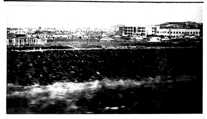
Partial view of another city in Korea with more than 50,000 people. This city is an an island of about 420,000 people. Picture by Louie Carver while on a journey.