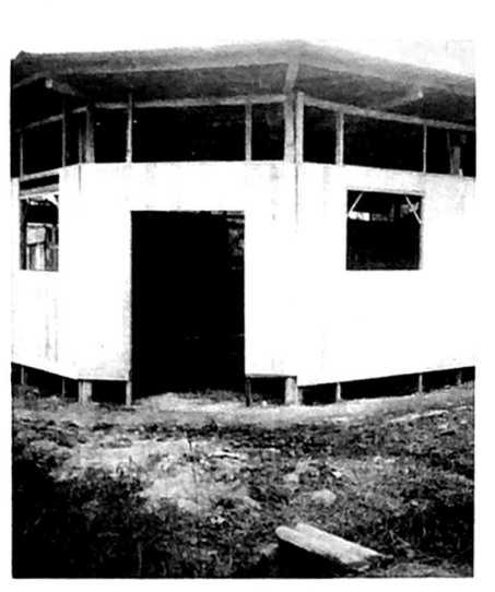
Fifth Mission Building, Iquitos, Peru almost finished except for the concrete floor. Select one of the projects and give toward it and watch it become a reality.