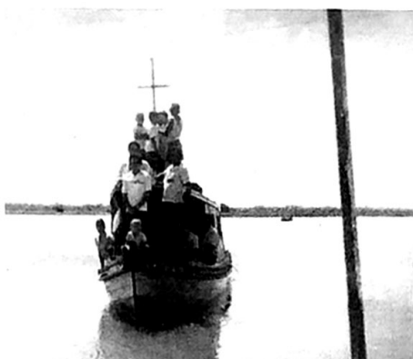
This boat with more than 40 persons on top and inside arriving for the Sunday morning service at 25th of December Baptist Church. Picture taken from mission launch.