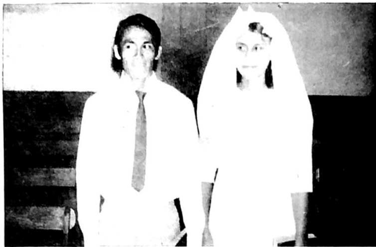
This couple got married in the First Baptist Church, Iquitos, Peru. Note the Bibles in their hands.