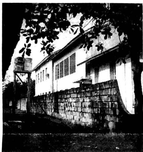
Back in Manaus from 300 miles up the Amazon River in the mission launch. Tabernacle church building front, Seminary auditorium with offices and breezeway underneath in middle, and two story class rooms in rear.