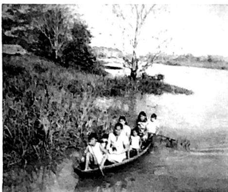
Coming to 25th of December Baptist Church, 300 miles up the Amazon River above Manaus. Everyone had to come to church by boat. Water was around and under the church building.