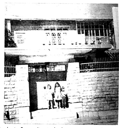
The Louie Carvers live in the four rooms upstairs here, in Seoul, Korea. Their children on the steps to the gate