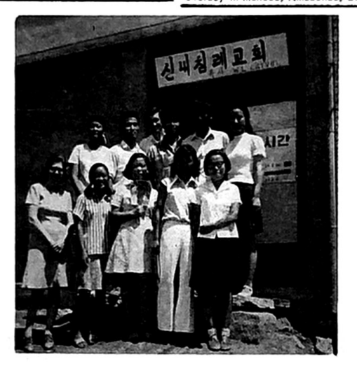
VBS in Seoul, Korea