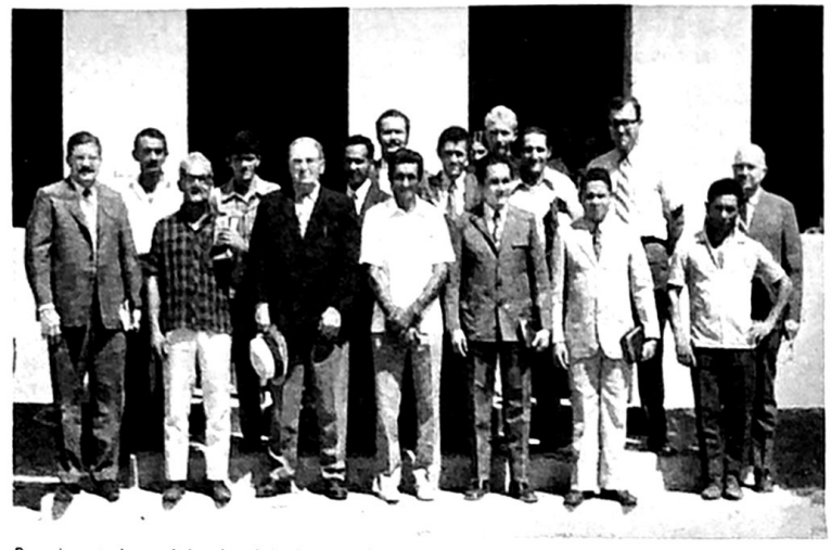
Preachers in front of the church building at the Conference in Ciuxeiro do Sul-