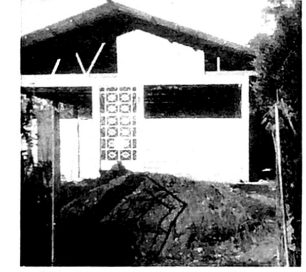
Homer Crain's church building in Tingo Maria, Peru. This picture taken just before the building was finished It was finished and dedicated just before he left for furlough